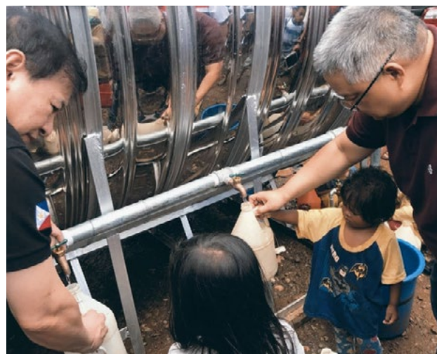
Water for Peace recovery project in the city of Marawi

Although the majority of humanitarian needs is driven by conflict, the private sector tends to be less involved in manmade disasters due to the elevated risks (such as political,