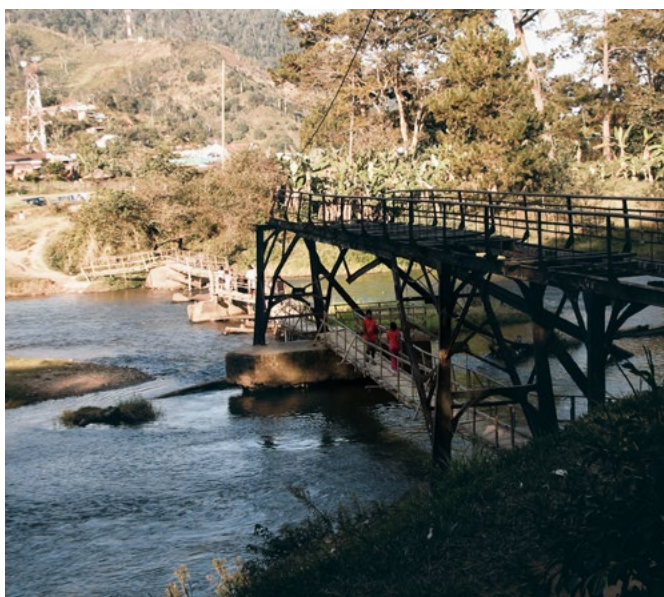
Improvised bridge in Madagascar in the wake of cyclone Ava

An international tsunami simulation exercise (IO WAVE 2018) gathered participants from 28 countries in Sri Lanka in September, at the invitation of the Asia Pacific Alliance for Disaster Management Sri Lanka (A-PAD SL) and the Ministry of Disaster Management. In December, the alliance arranged a training of trainers on business continuity planning using the tool Resilience-in-a-Box . This activity was conducted in collaboration with The UPS Foundation, US Chamber of Commerce Foundation and the Turkish organization Saglam Kobi.